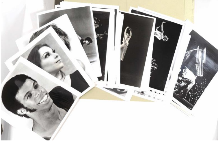
Sample of photos – Joffrey Ballet